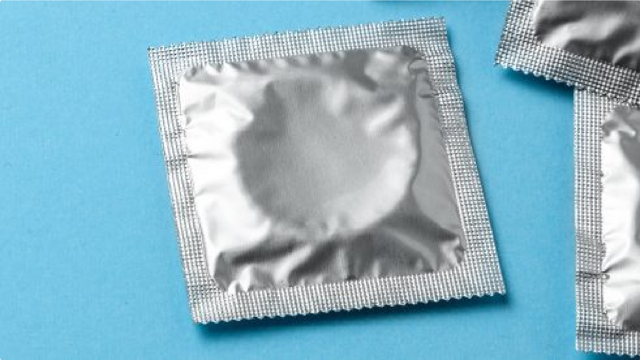
Protection from STIs

Clinicians should determine the appropriate level of risk-reduction counseling for each patient. For example, if a patient is in a mutually monogamous relationship, risk-reduction counseling may not be needed unless the patient or their partner is engaging in activities that will put them at risk.